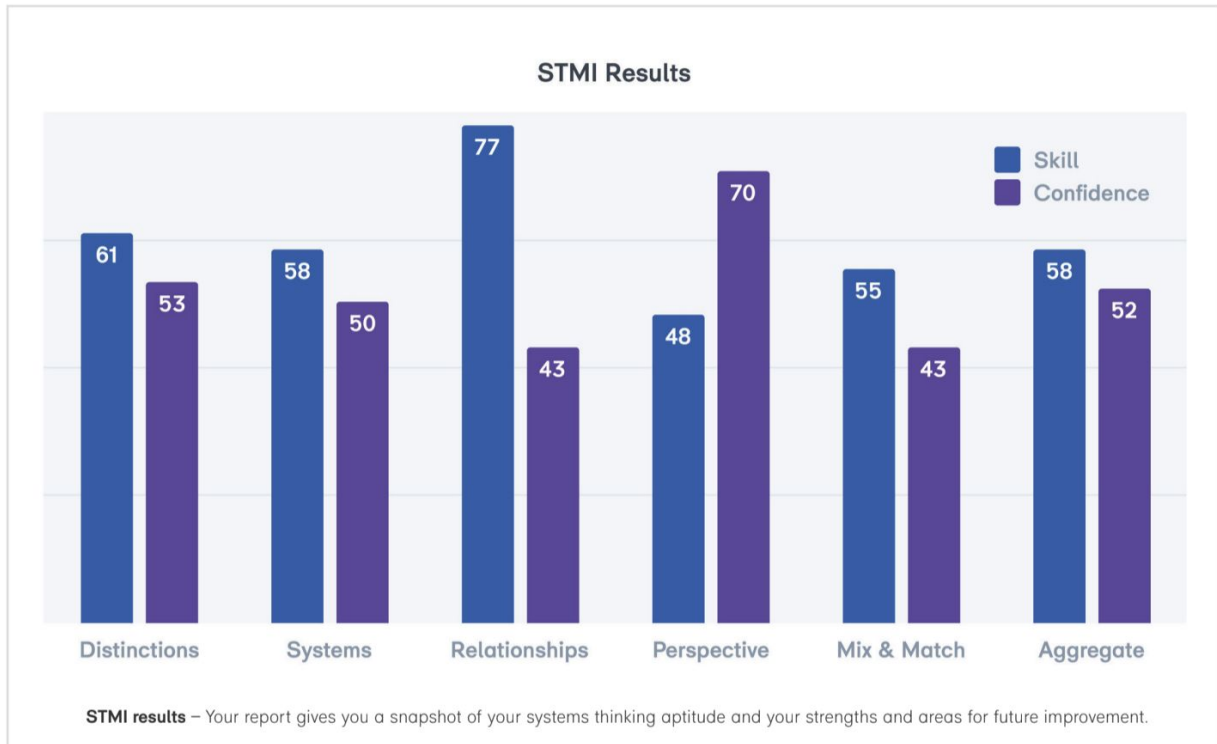
Figure 3: Comparative Skill and Confidence scores (10 dimensions) and aggregate scores

strengths in some of the skills and is seeking diagnosis of areas of growth to become a better systems thinker and more metacognitive. As such, separate items measure metacognition using modified items from the previously validated MAI (See above or [67] pg. 472).